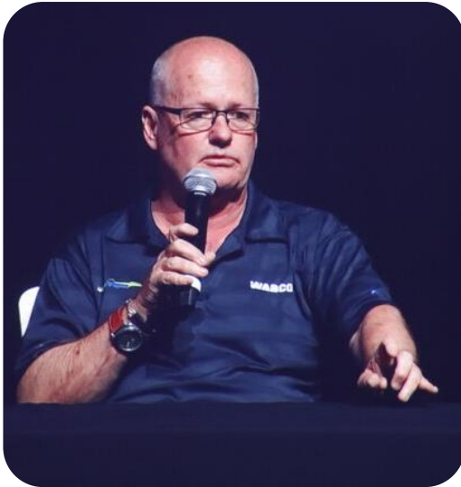
Glenn Hambleton Air Brake Systems