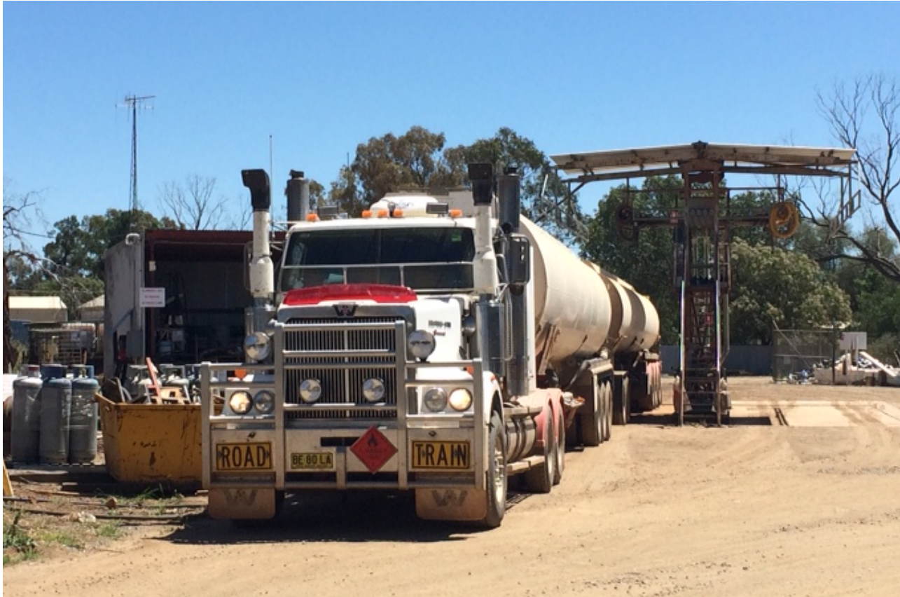
Photo – Twenty five year old trailers excellent condition, western NSW