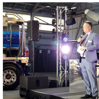
Photo Gallery from new high spec stainless steel tanker launch